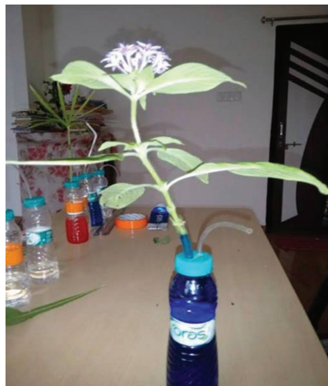
Figure 3. Operation of the potometer with colored water.