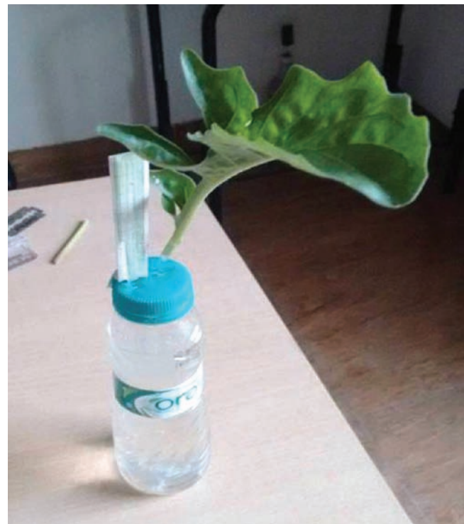
Figure 2. Operation of the potometer with water.